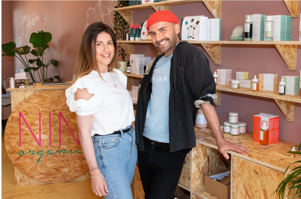
Nina Organics at Ebury Edge, open now