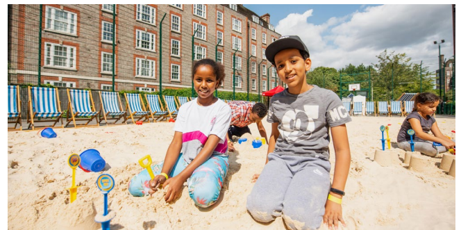
Residents at Ebury's first Beach at the Bridge event