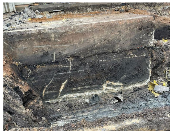
Relics of the 18th century canal wall

The waterworks supplied drinking water to many central London locations including the West End. Unfortunately, the cleanliness and quality of this water wasn't to the satisfaction of its recipients who suffered illnesses such as Dysentery and Cholera. By 1829 complaints had become so loud that the company became the first in the country to install a slow sand filtration system to purify the water, finally providing Londoners with clean drinking water!