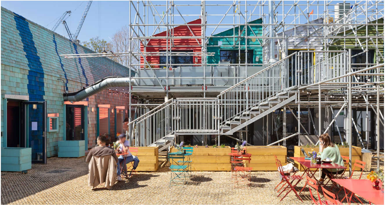
Ebury Edge caught in the sun