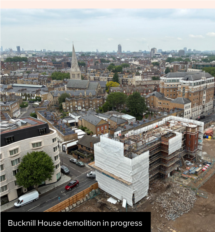
Bucknill House demolition in progress

Digital Mailing System To receive the latest about the demolition and the Ebury Bridge Regeneration, sign up to our digital mailing system! survey.eburybridge.org