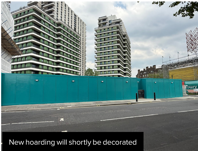
New hoarding will shortly be decorated