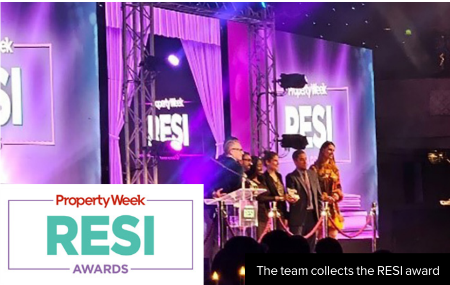
The team collects the RESI award

We are very proud that earlier this month Ebury won the RESI Award for Development of the Year for over 500 homes. The RESI Award is an important recognition in the world of Regeneration and Development. It's always exciting to win an award, as it marks the efforts and shared time and work established between the team and the community over time. Judges highlighted Ebury's sustainable build and bold efforts to create an inclusive and cohesive multi-tenure community.