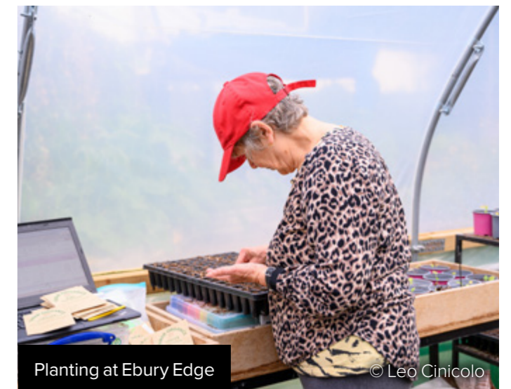
Planting at Ebury Edge

Tasks include seeding, planting, weeding, watering and harvesting. All are welcome, tools are provided, no previous gardening experience is necessary.