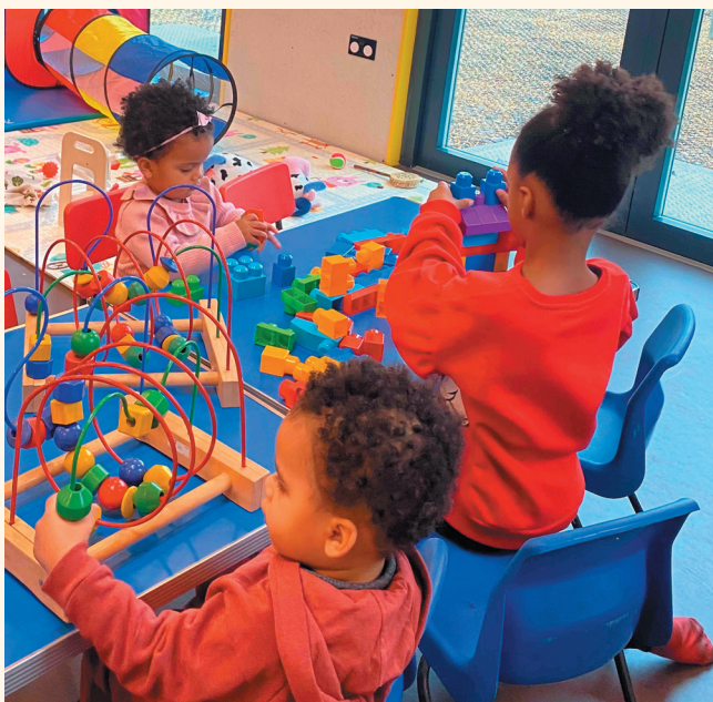
Carly's Angels nursery

This workshop will provide you support with managing your finances in the best way possible.