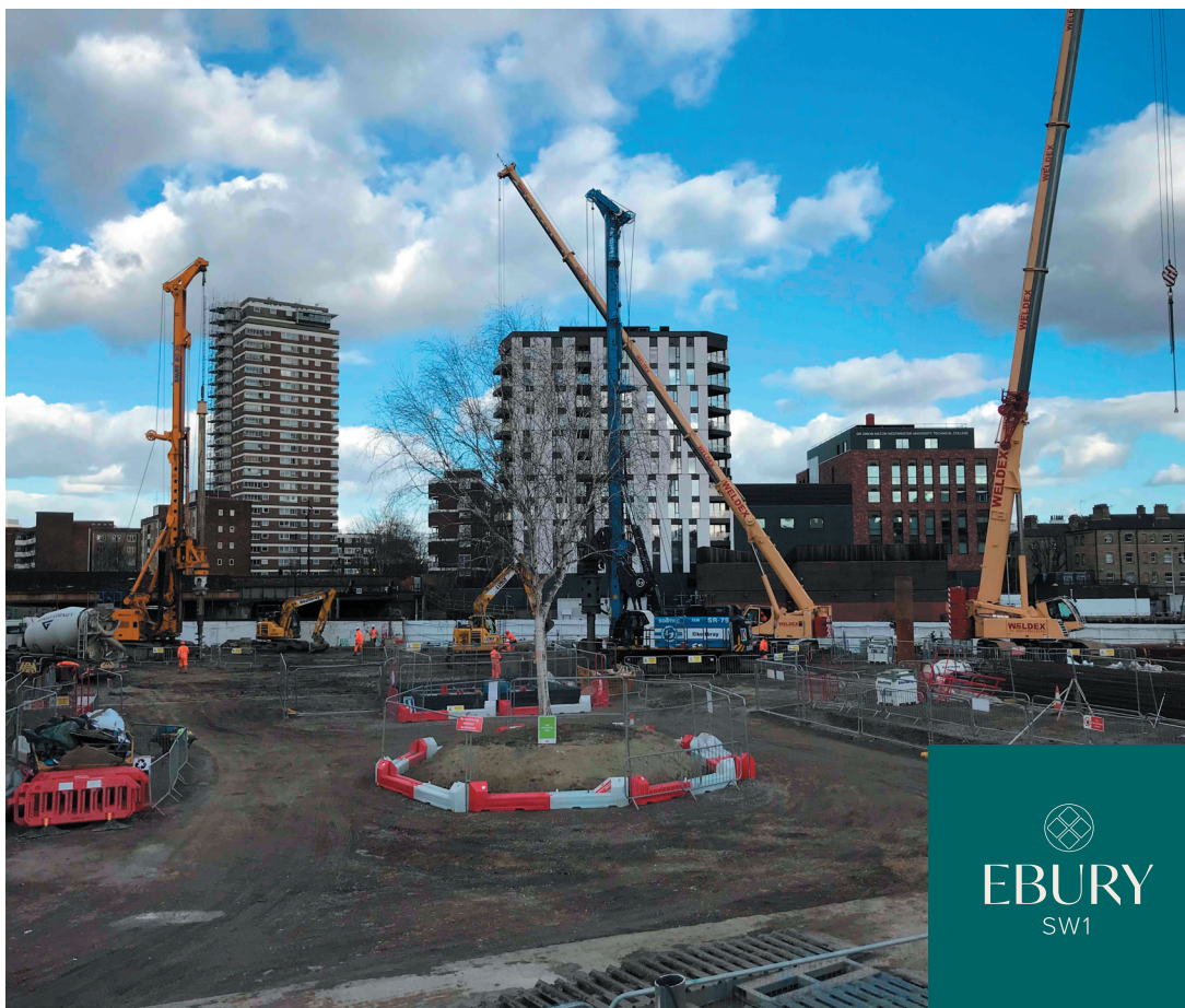
Ebury site at the moment